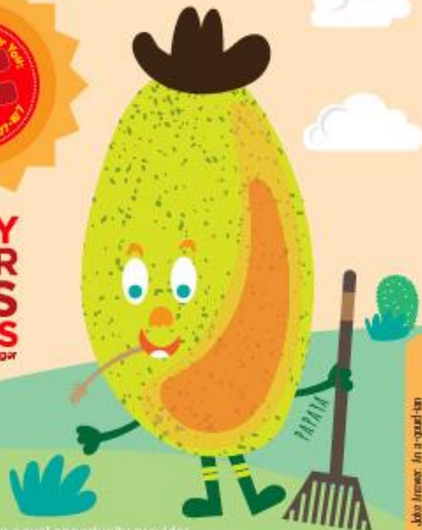
Joke Answer: An a-squid-ian Message: Native American

HEALTHY SUMMER MEALS FOR KIDS No Cost For Kids 18 and Younger