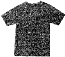
VIOLET COMFORT COLORS T-SHIRT