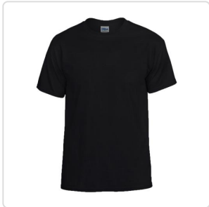
BLACK BASIC SHORT SLEEVE T-SHIRT