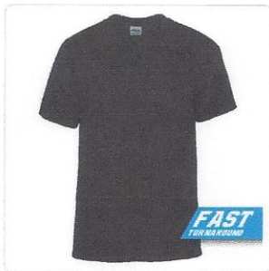
BLACK BASIC SHORT SLEEVE T-SHIRT