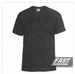
PURPLE BASIC SHORT SLEEVE T-SHIRT